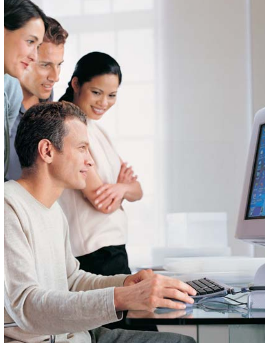
Photo printing on demand

Now you can choose from art paper, matte coated paper, CAD media, photo glossy paper, satin, thick-coated paper, flame resistant cloth and more - for a greater variety of printing options.